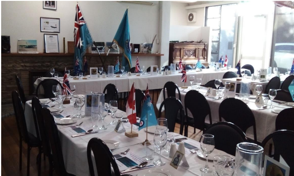
The Dining Room set up for 52 people. Table Flags from those countries from whence the Dambuster Crews came were displayed – Australia, the UK, New Zealand and Canada. Souvenir Place Mats were featured as well a souvenir Menu Cover. Each attendee also received a special 80 th Anniversary Dambuster Lapel Pin.