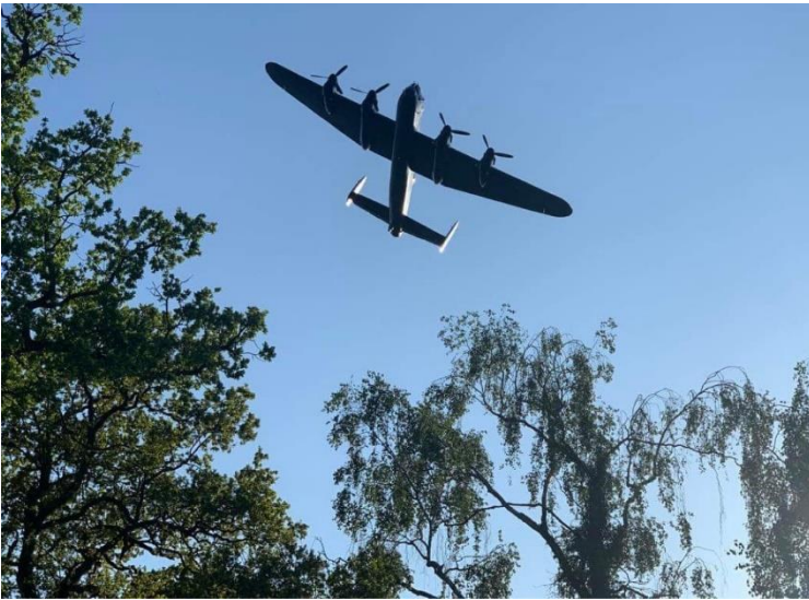
A Lancaster overflies the Petwood Hotel at Woodhall Spa UK on Saturday 20 May 2023. It was part of the 80 th Anniversary celebrations in the UK by 617 Squadron